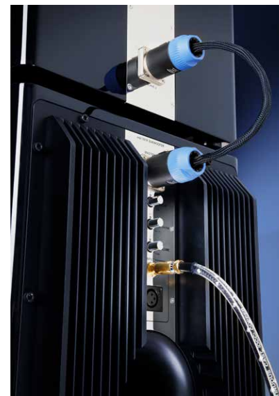
The X-Treme's master subwoofer control center, one for each channel.