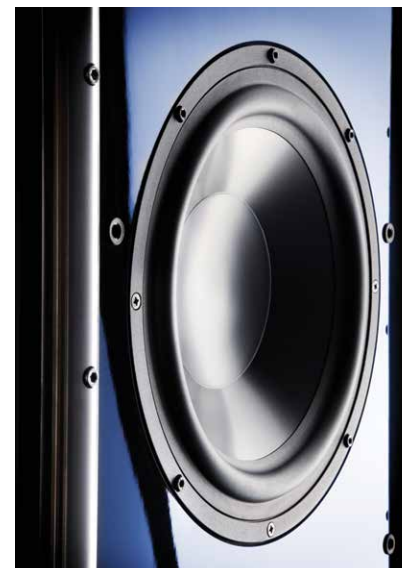
The twin-layered 12" aluminum membrane subwoofer driver, one of twelve in an X-Treme system.

Omnis in general (and the 101 X's par excellence ) deal with room modes in an entirely different, rather more “generalized” and purely acoustic way—by flooding the entire listening space with full-range sound, coming (because the speakers radiate omnidirectionally both horizontally and vertically) from a nearly infinite number of different elevations and a nearly infinite number of