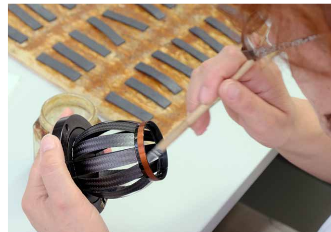
Hand-crafted, woven carbon-fibre segments in a midrange driver.

Possessed of the most seamless blend with main speakers I've heard, the sub stacks delve very very deep and do so with precisely the kind of richness you hear from bass-range instruments in real life—nothing is thin or razor-cut (all transient and no body); on the contrary, everything is warm, round, fast, cleanly defined in pitch, beautifully robust in timbre, perfectly timed in duration, and immensely powerful in inten-