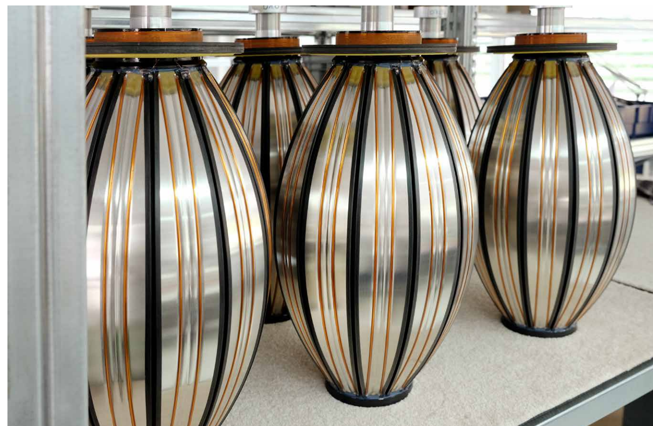
Completed Radiastrahler woofers waiting to be mounted.