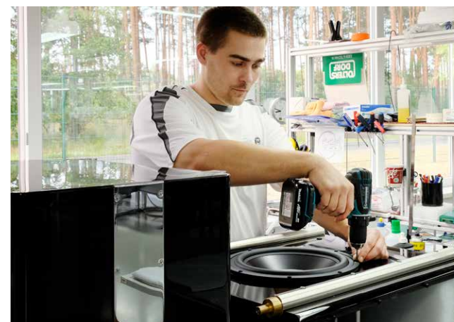
Construction of a push-push subwoofer cabinet.