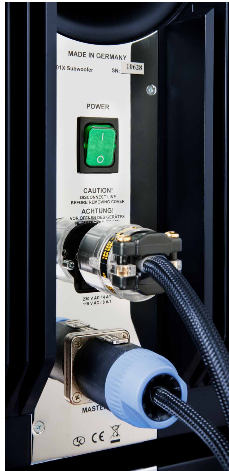
Subwoofer power amplifier with umbilical cord.