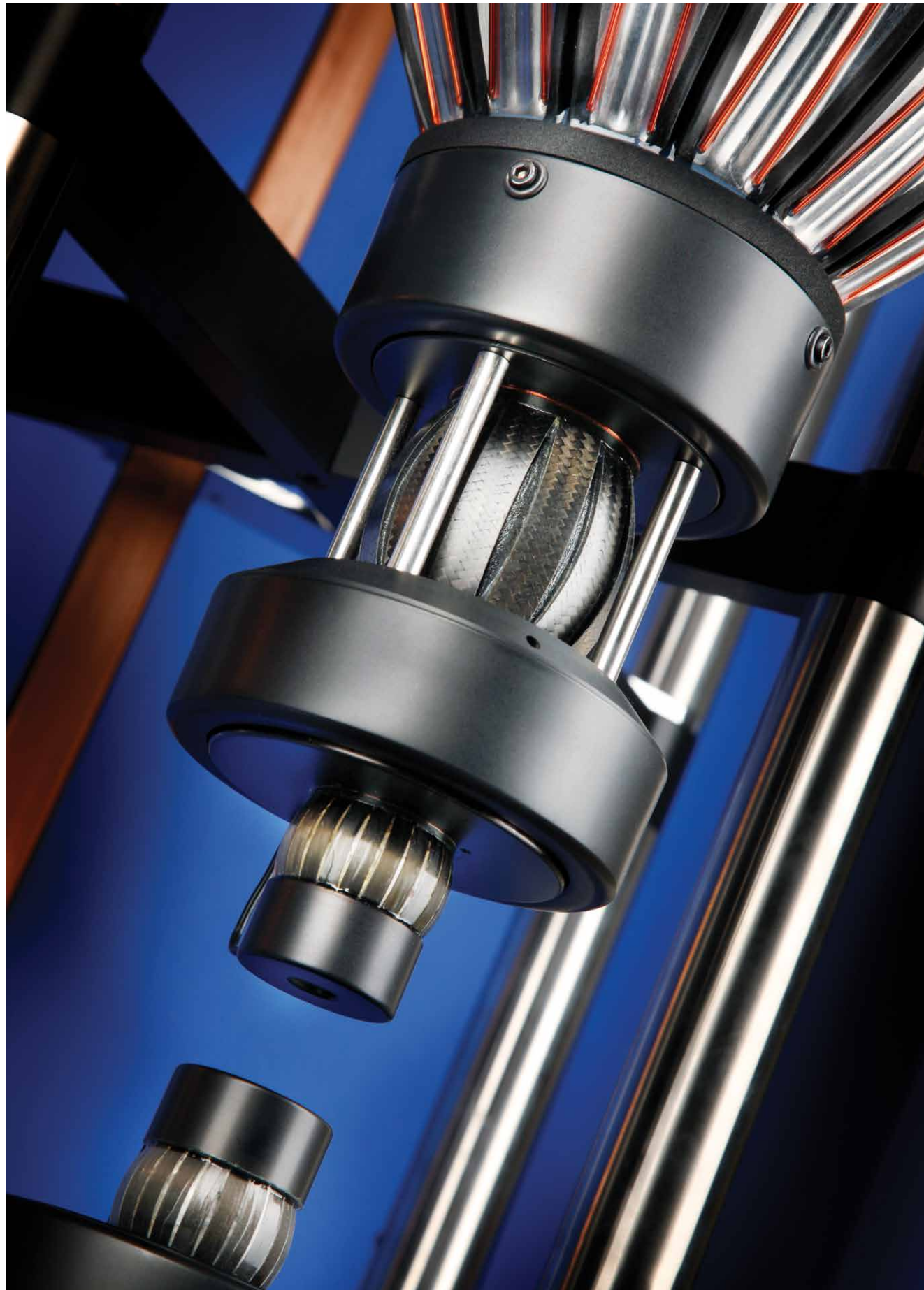
The meticulously hand-crafted MBL Radialstrahler tweeter and midrange drivers in the Omni tower's solid stainless steel exoskeleton.