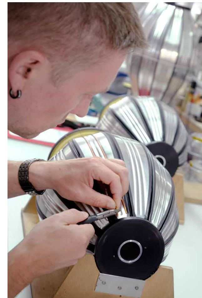
Attaching structural copper rods to the woofer.