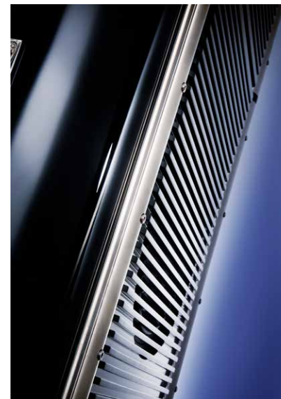
Detail of the X-Treme's subwoofer cabinet and grille, with solid stainless steel exoskeleton.