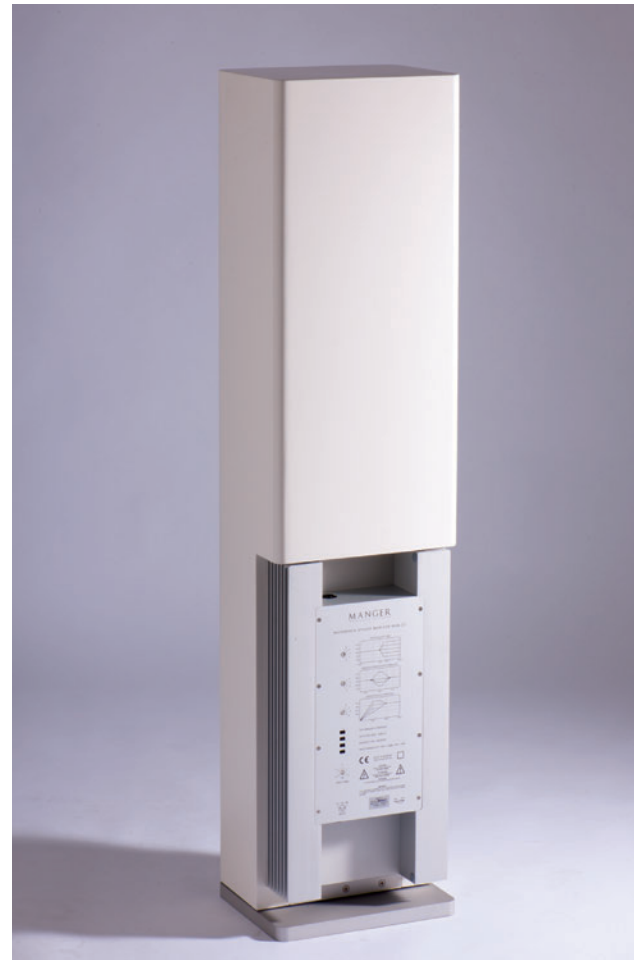
The backside of the MSMs1 offers many options for individual adjustments