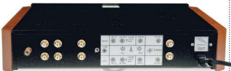
ABOVE: The extra pair of phono sockets is for plug-in resistors which adjust MC load impedance. When none are fitted, as here, the load is 47k ohms