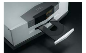
Aluminum disc tray

The D700 boasts an upgraded CD/SACD drive mechanism to achieve greater accuracy in signal reading. The sturdy disc-drive unit comes with a high-precision loading mechanism that opens and closes the disc tray with little vibration or noise, thanks to the built-in metal shaft bearings. The pickup employs an infinite conjugate optics system that ensures both stable operation and high-precision signal readout. The rigid disc tray is made of meticulously machined aluminum to suppress vibration and has a vibration-dampening black coating to prevent the diffusion of a laser beam and achieve even greater accuracy in signal readout.