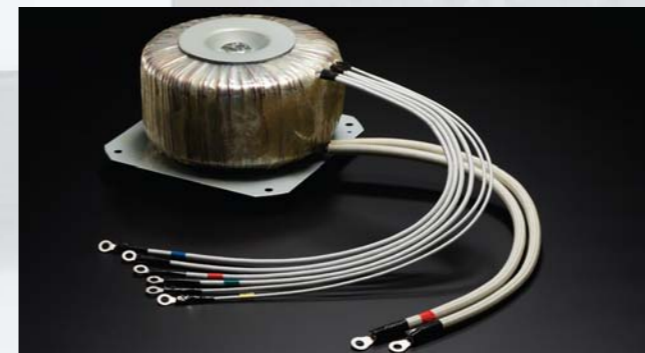
High-output toroidal transformer

A powerful transformer plays a critical role in ensuring highly stable power supply and fast responses. In the D700, a powerful toroidal transformer with a 400 VA power rating—not uncommon in power amplifiers but unheard-of in disc players—powers the audio circuit to achieve greater signal transition performance. The entire power supply is housed in a sturdy die-cast aluminum monocoque chassis to suppress unwanted vibrations. To increase the purity of power supply, the internal coil of the transformer is directly connected to the power supply circuit, minimizing the contact points with lead wires. Furthermore, terminals for directly connected coils, mounting terminals for motherboards, and clamping screws are all made of oxygen-free copper coated with nonmagnetic materials to eliminate even the slightest magnetic distortions. The result is more faithful reproduction of recordings of pianissimo sections, as well as those of full-scale operas and symphonic orchestras.