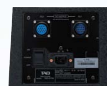
Power supply rear panel