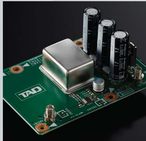
Ultra-High C/N Master Clock UPCG

In designing disc players capable of providing the most accurate sound reproduction, TAD has been focused on achieving greater C/N performance by reducing jitter in the lower frequency sideband ranges relative to the center frequencies. With the D700, we have taken an extra step by incorporating an oscillator with an SC-cut crystal to reduce phase noise even further. This oscillator was jointly developed with a crystal manufacturer and has a minimum level of temperature deviation for oscillation at room temperature. The upgraded third-generation UPCG with a ultra-high C/N master clock is responsible for smooth and dynamic reproduction of music with superb spatial characteristics. The oscillator delivers consistently high C/N performance over an extended period of time and operates reliably and with low power consumption.