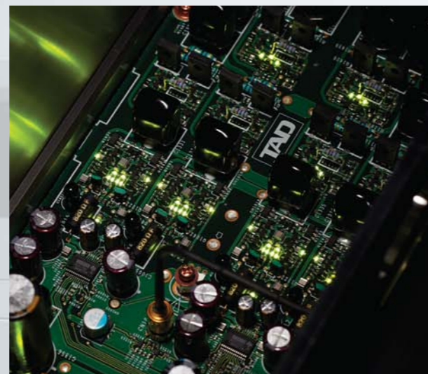
Audio output circuit

TAD's pursuit of simplicity has culminated in a newly developed current-feedback amplifier incorporated into the D700's I/V converter, which feeds back current coming from D/A converters without altering it. This design achieves lower impedance and greater noise-resistant characteristics, contributing to pure signal transmission. Its input stage is equipped with FET devices hand-selected and paired by our certified specialists. This ingenious design enables a ultra-wide-range signal transmission, resulting in an unprecedented level of precision in signal conversion. Our attempt to eliminate magnetic distortions has taken a step further. The nonmagnetic, highly reliable carbon resistors used for feedback resistance contribute to a nonmagnetic signal path. The combination of TAD's proprietary discrete circuit design and carefully selected high-grade components improves signal linearity ranging from very weak to very strong levels, bringing out the real presence of music.