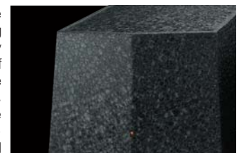
Patterns that give a three-dimensional illusion

The D700 is housed in an enclosure built with the combination of die-casting and cutting processes, which is rarely seen in hi-fi components. The design of the die-cast aluminum chassis of the main unit and the power supply is inspired by stone walls of Japanese castles, with the patterns on the surface chosen to give a dynamic and three-dimensional illusion.