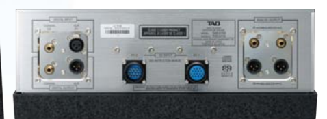
Main unit rear panel